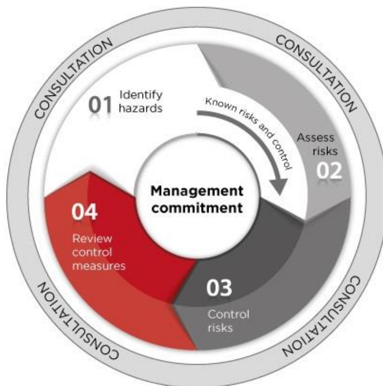
Figure 1 The risk management process

Further information is available in the Interpretive Guideline: The meaning of 'reasonably practicable' . The process of managing risk described in this Code will help you decide what is reasonably practicable in particular situations so that you can meet your duty of care under the WHS laws.